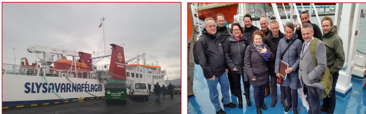
Figure 4. Participants of the NKS-B COASTEX Workshop on-board Sæbjörg ship – meeting place for the workshop in Reykjavik.

While discussing the ‘table-top exercise concept’ vs. an ‘exercise guide’, it was decided that ‘the exercise guide’ is more suitable to the project results and generally could be used when organising different types of exercises (including a table-top), whereas the ‘table-top exercise concept’ is restricting the outcomes and achievements of the COASTEX project.