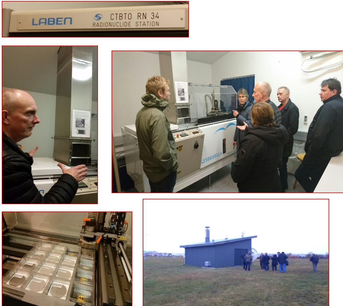
Figure 2. Participants of the NKS-B COASTEX project visiting CTBTO IMS station in Reykjavik.

Using the opportunity and in cooperation with IRSA, project partners visited the CTBTO IMS radionuclide monitoring station ISP34 upon arrival to Reykjavik on 11 th of October.