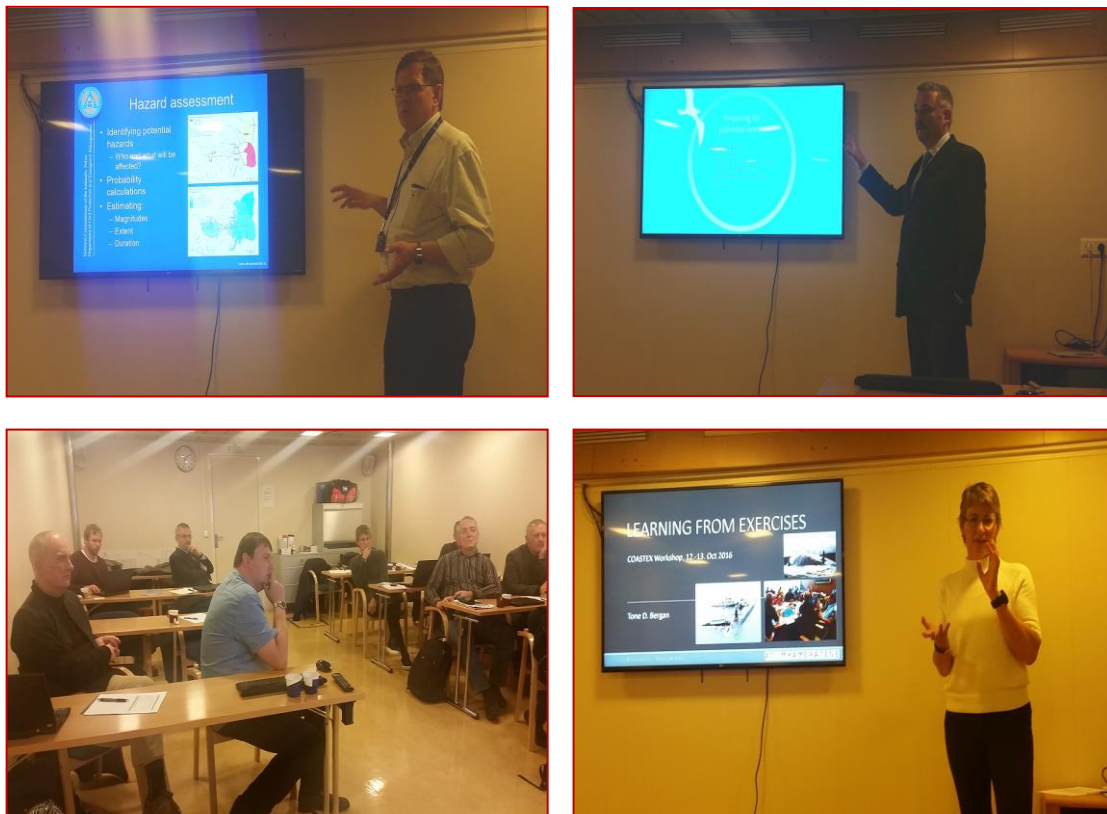
Figure 3. Invited speakers and discussions at the NKS-B COASTEX Workshop in Reykjavik.

While discussing scenarios, it was decided to include two more actual scenarios: