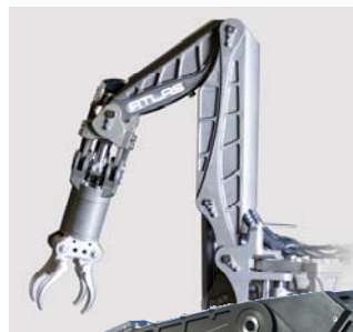
Two different arms