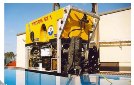
ROV as used in Oil industri