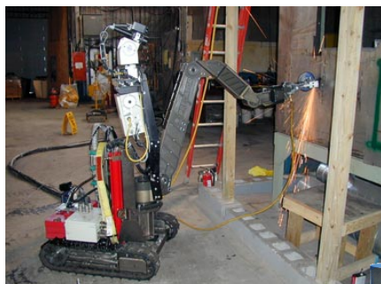
Mock-up test of cutting up steel liner